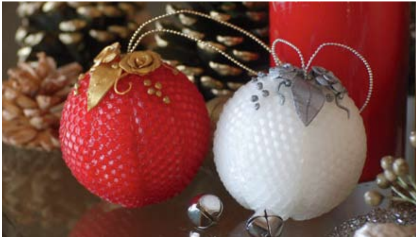
project size: 3"