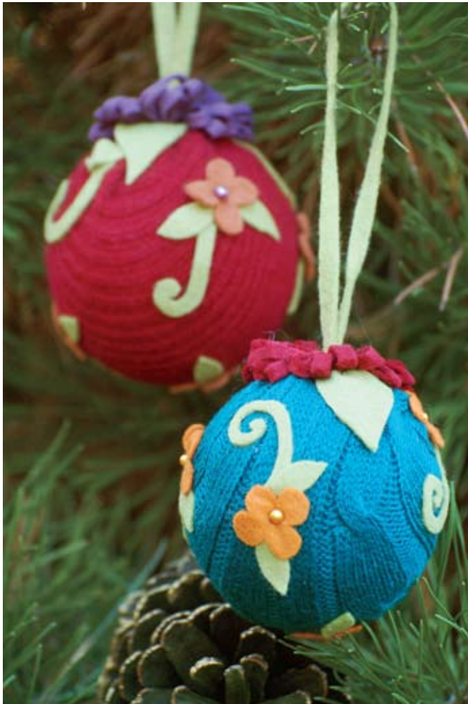
project size: 3"